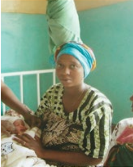
A woman and her young child at the St. Francis Rwambaizi Health Center.