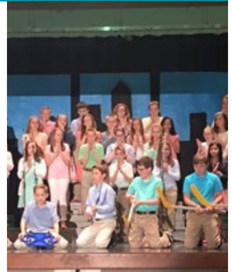
Students are shown performing one of their songs. The boys enjoyed drumming with basketballs, hockey sticks and skate boards! What a fun touch!!

The ambulance has been refurbished and is ready to provide emergency transport for pregnant women and children to the Nyakahanga District Hospital, which is over 20 miles away. The repaired ambulance will also enable health care personnel to travel to six villages and other outlying areas to provide health education and medical care to pregnant women and children. ■