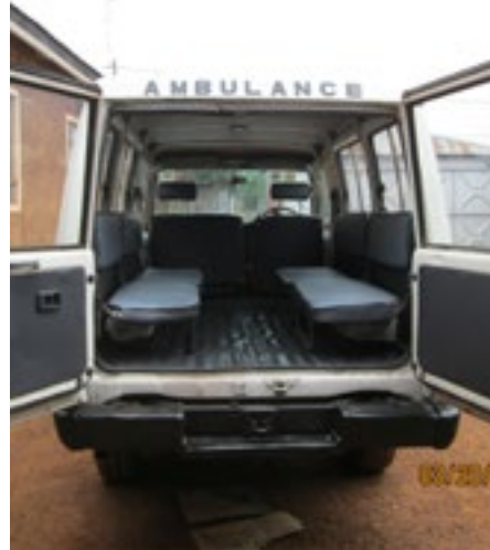
Refurbished Ambulance at St. Francis Rwambaizi Health Center, made possible by a generous COHF supporter!

A donation of $25 could literally save the life of a mother and her infant or the life of a young child. ■