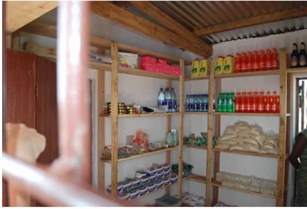
Kiosk provides teachers, staff and local people staples while generating income for the school