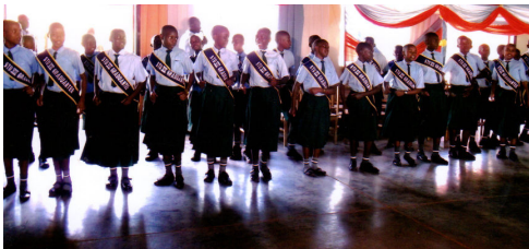
Grade VII Graduands at St. Peter Claver Grade School

St. Peter Claver Primary School celebrated their 10 th Anniversary this year! It is amazing what the school has accomplished in a relatively short time. In this issue we will highlight some ways in which