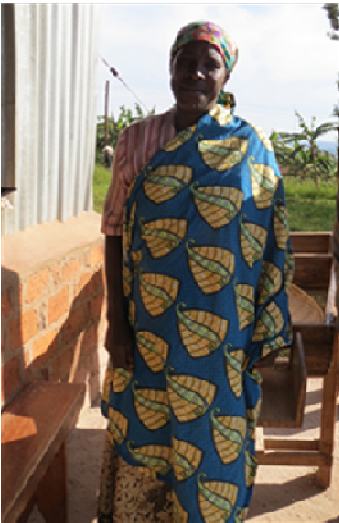
Woman from a nearby village brings corn to the mill.

Children of Hope and Faith has supported projects at St. Peter Claver School to benefit all of the students and also to generate income. Our first project, the corn husking and grinding mill, is so successful that they were able to start another mill in Omurusimbi village. This will help the villagers obtain cornmeal and provide additional income for the school. Through the years we have supported animal projects to provide the students a reliable and cost-effective source of meat and