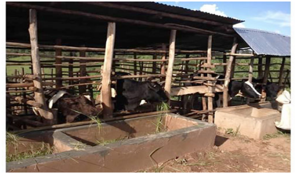
Friesian dairy cows provide the children milk.