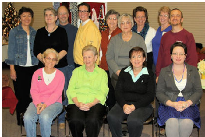
Our fabulous crafters for Arts & Craft Bazaar at Holy Cross Church