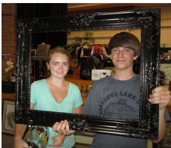
Two student volunteers for GarageSale at The High School of St. Thomas More

This time of year, in particular, we make a point of expressing our gratitude for the gifts and blessings we have received. So, we'd like to take this opportunity to thank our fabulous volunteers. COHF holds two major fundraisers and assorted programs each year and we would not be able to do so without the generosity of many volunteers. Our volunteers are special to us, and it is always a joy to work with you! Please accept our heartfelt thanks! We are most grateful that you are willing to share your time, talent and treasure to help our brothers and sisters in Christ. Living the faith: 'Love of God and Love of Neighbor' are hallmarks of our community of which we are both humbled and privileged to be a part. May God bless you!