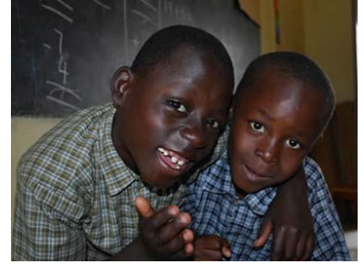
Boys in the classroom at Angel

milk. A Kiosk was funded to provide staples for the teachers and staff who live at the school. It is also available for the local people, which help the school with income. COHF funded shelving for the library, donated books and provided funding for the purchase of much needed textbooks. Electricity can be very unreliable in Tanzania! The principal requested that COHF fund a generator as a source of electricity during power outages. We thank Holy Cross Church and The High School of St. Thomas More who sponsor children at St. Peter Claver School for contributing toward this project.