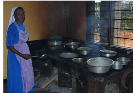
Franciscan Sister cooking for children at Angel Home. The stove is heated with firewood.

Angel Home Orphanage has flourished with the help of Children of Hope and Faith and the loving guidance and hard work of the Franciscan Sisters of St. Bernadette. The orphanage was expanded to enable young children to