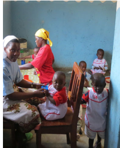
Providing food for God's Little Ones

As always we thank our faithful sponsors who make this work possible. We are facing increases in tuition costs at most of the schools where students are sponsored. Our scholarship fund is now ex-