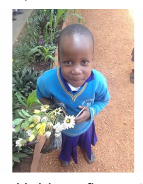
Little girl giving us flowers at St. George Cathedral Kindergarten program from the Bishop's garden!