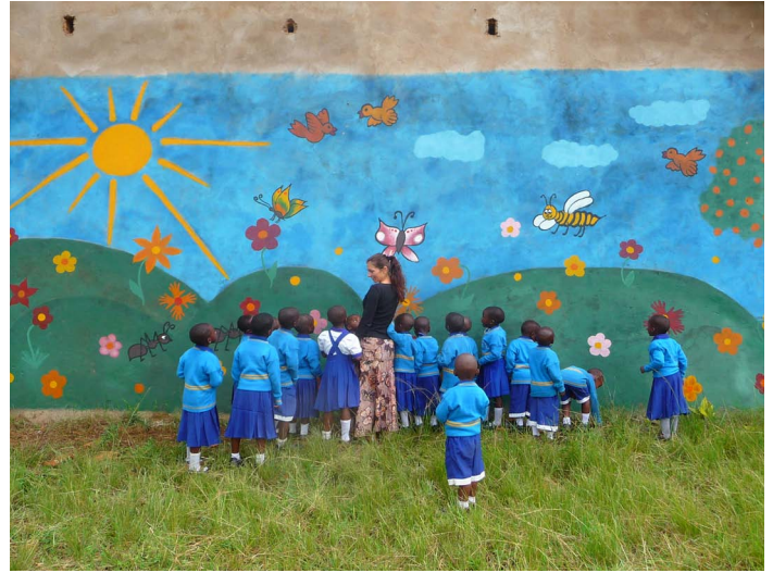
A mural in the current "classroom."