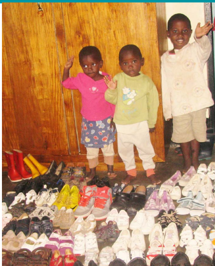
Children at Angel Home with the new pairs of shoes!!

Please support the matching gift challenge to raise funds to continue construction of the classrooms. ■