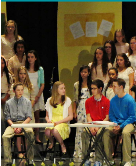
St. Matthew's Students