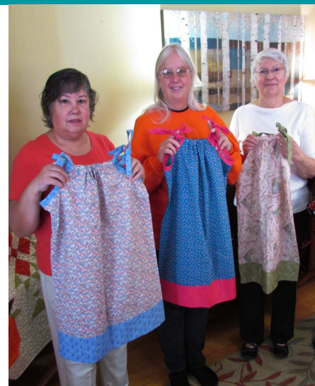
St. John Paul II parishoners

We very much appreciate receiving a grant from the Poverty, Justice and Peace Fund. This will help provide daily care for the children living at Angel Home. The grant also assists with scholarships for children from Angel Home to attend primary school. ■