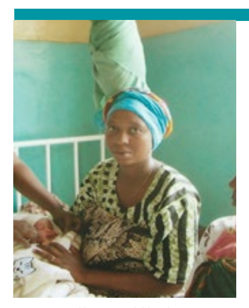
A woman and her young child at the St. Francis Rwambaizi Health Center.