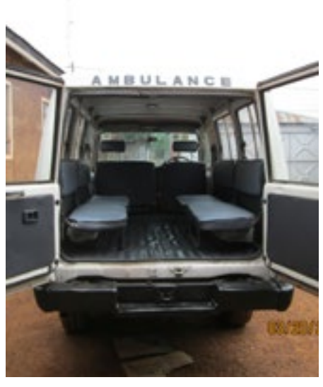
Refurbished Ambulance at St. Francis Rwambaizi Health Center, made possible by a generous COHF supporter!

A donation of $25 could literally save the life of a mother and her infant or the life of a young child.