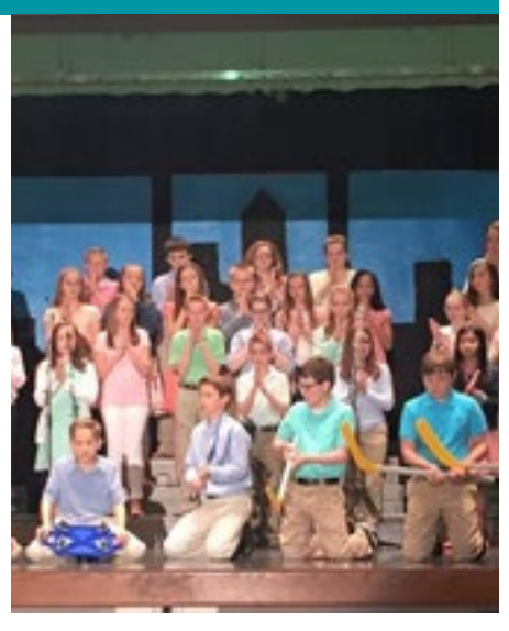
Students are shown performing one of their songs. The boys enjoyed drumming with basketballs, hockey sticks and skate boards! What a fun touch!!

The ambulance has been refurbished and is ready to provide emergency transport for pregnant women and children to the Nyakahanga District Hospital, which is over 20 miles away. The repaired ambulance will also enable health care personnel to travel to six villages and other outlying areas to provide health education and medical care to pregnant women and children.