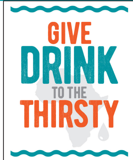
This Lenten Season, show some gratitude for access to clean water!

Secondary School (high school) is designated as Form 1 through Form IV. Upon graduation from Form IV, students take a National Exam. It is extremely important for the students and the academic ranking of the school that they perform well on the National Exam. Their score on the exams determines their ability to continue in secondary school in Form V and Form VI. National Exams are taken again after Form VI, which determines their options for post-high school education. ■