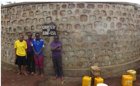
Students at water tank collecting water in buckets for use in drinking, cooking, bathing, laundry and cleaning.

Teachers, staff and night watchmen also live at the boarding schools. The teachers are very appreciative that they can more easily cover their required syllabus since they are able to prepare lessons and grade papers and tests at night. Security is also a major issue for the rural schools that do not have electricity. The night watchmen are happy to have lights to see better as they keep the student body safe. An adequate and reliable source of electricity will also enable more use of computers and office equipment. It is hard for us to imagine operating a high school without electricity! ■