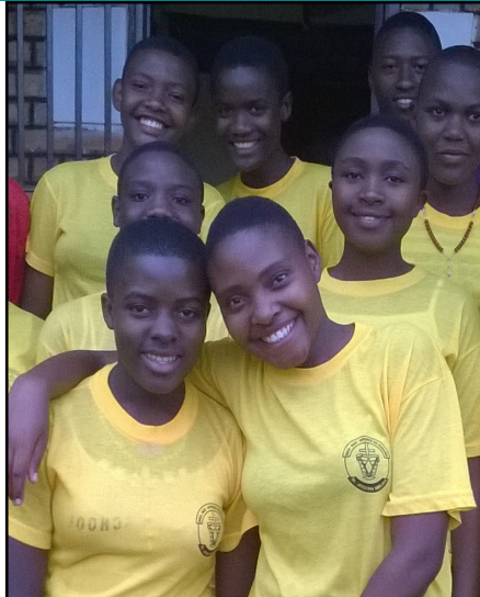
Students at St. Joseph Vocational Secondary School in the Rulenge-Ngara Diocese

An operating room for St. Francis Health Center has been funded and is still in the process of being implemented. Equipment for C-sections was provided which will help to save many lives. Women still frequently die in childbirth in this area of Tanzania. ■