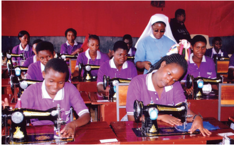
Girls at St. Severine learning how to sew.