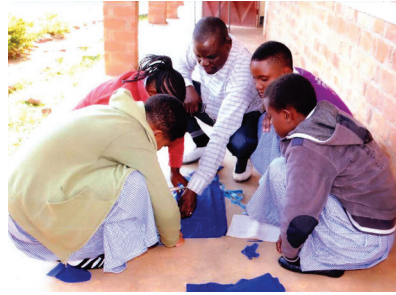
Girls benefitting from instruction from their teacher who is a tailor.