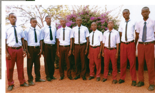
Young men sponsored through COHF at St. Charles Lwanga Junior Seminary who benefitted from your generosity.