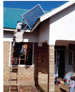
(Below) Solar energy panel being installed at St. Bonaventure.