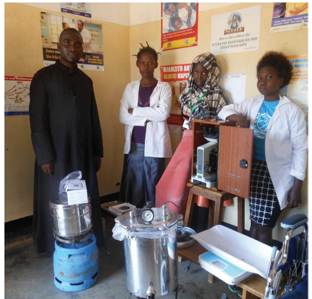
Showing the purchased medical equipment for St. Vincent Businde Catholic Dispensary, Kayanga Catholic Diocese.