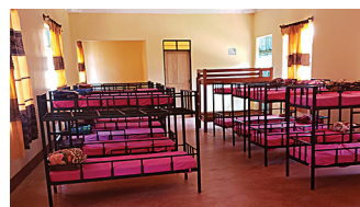
Three views of the new dormitories.