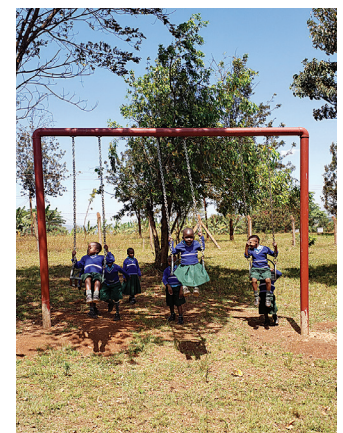
Two of our supporters donated a swing set for St. Peter Claver School. The children have been asking for playground equipment since the school began in 2003. It's so wonderful to see them enjoying it!