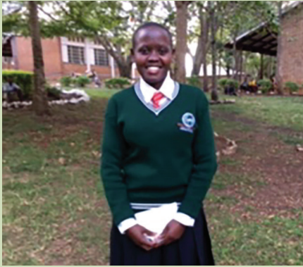
Pendo at Karagwe Secondary School