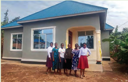
Older girls who will benefit from the new home