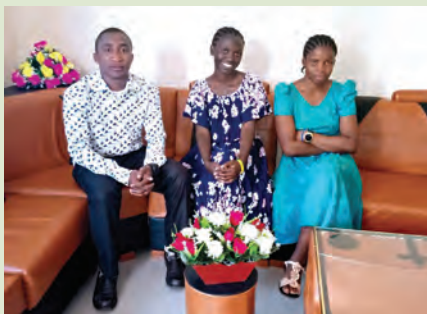
Children in the community (living) room

When Children of Hope and Faith started all the children at Angel Home were very young. The Franciscan Sisters of St. Bernadette began to keep the children in the hope that they would be sponsored in Catholic primary schools. The first group of children are now young adults! They all attend upper-level secondary school or have started post-secondary education. The dormitory at Angel Home is too small to accommodate both the older and younger children. A home for the older children to call their own was long overdue!