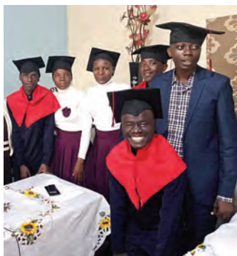
Sponsored children who recently graduated from St. Joseph Secondary School