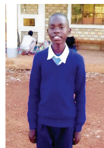
Ivanus Zilimu Kwauso Secondary School $350/yr.