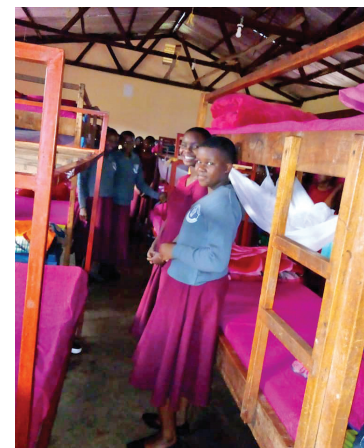
Girls happy to have a place to live so they can begin their studies in high school.