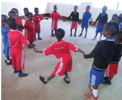
Kindergarten students having fun at recess.