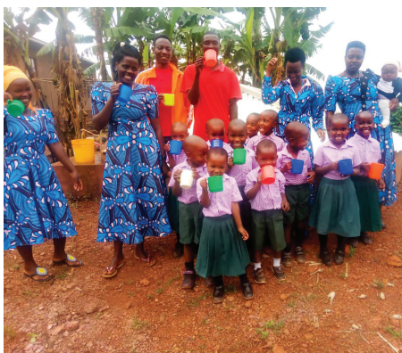
Pictured are students and teachers enjoying the life-giving gift of clean water.