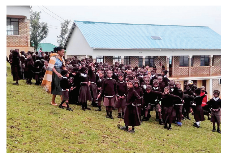
Students at St. Bonaventure excited about the lighting provided by solar energy for their dormitories and classrooms.