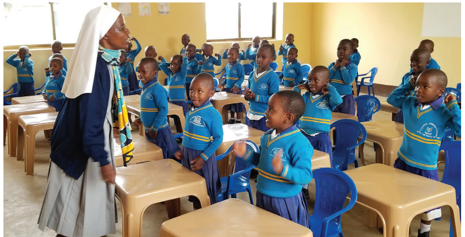
Students at St. George Kindergarten class excited about our visit.

The mission trip was a great opportunity to visit Angel Home Orphanage, the schools, and our sponsored students. Thank you to all who donated teaching materials for the newly formed kindergarten programs. We presented teachers at four schools with the much-needed classroom supplies. They very much appreciate your kind assistance.