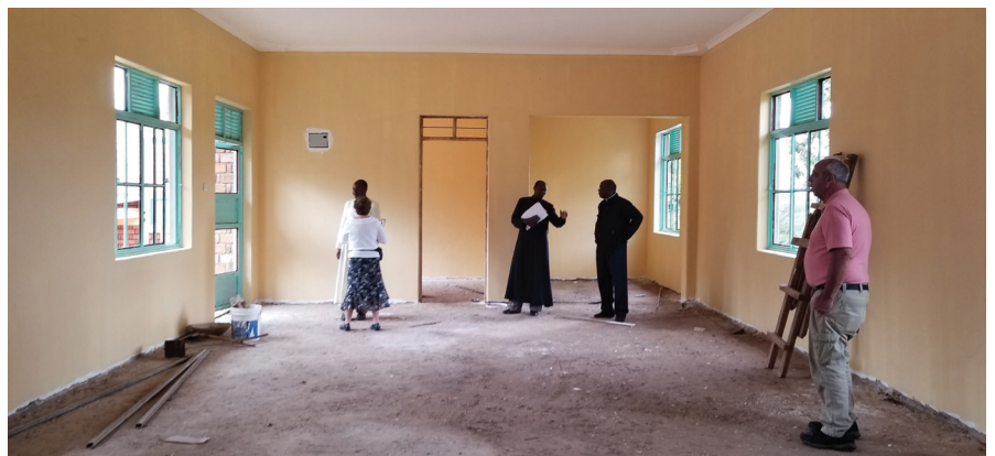
Boys' Dormitory - assessing progress of construction during our Mission trip.