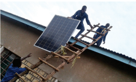
New Solar Panels being installed at St. Vincent Businde Dispensary.