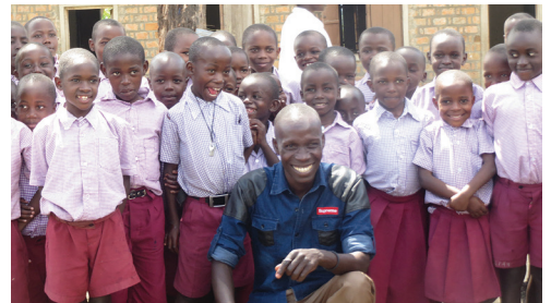
Children at St. Augustine Primary School who will benefit from the project.

The school is in desperate need of a large water tank (100,000 liters) to collect rainwater for drinking, cooking and good hygiene. They also need a sewage system and new bathrooms for boys and girls. The school does not meet Government health department standards, so this is an urgent and acute need.