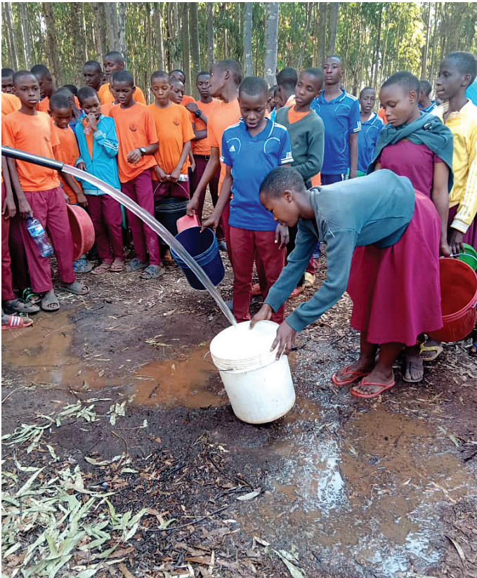
Students collecting water for bathing.