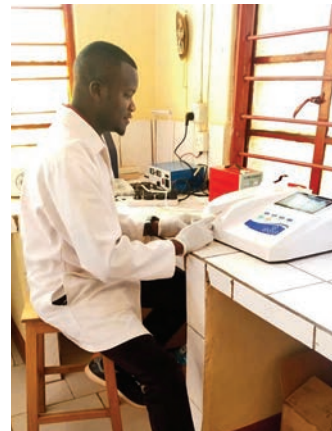
Technician operating the new chemistry machine