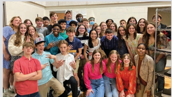
Eighth grade class who wrote and performed the skits for "Climb Higher"