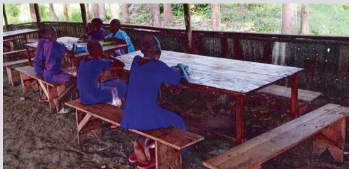
Students eating in the temporary shelter.