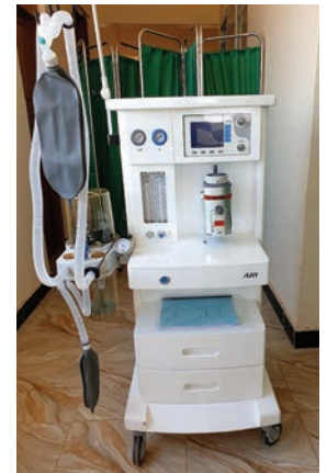
Requested Anesthesia Machine