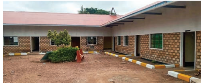
Renovated St. Vincent Businde Dispensary

Fr. George, Secretary of Health Care for the Diocese, requested continued assistance for St. Francis Rwambaizi. The priority of requirements for the health care facility are a blood bank freezer to store blood for surgeries ($2,000), a new anesthesia machine ($5,000), and continuation of the Outreach Program ($3,000). ■